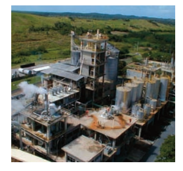
Our facility in Cabo, Brazil is one of several Corn Products plants that is ISO 14001 certified.